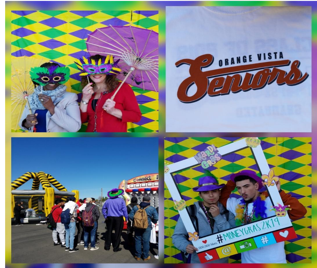
Orange Vista's Annual FAFSA celebration MoneyGras